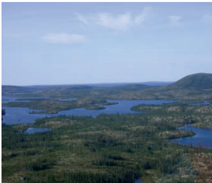
ENVIRONMENTAL BASELINE STUDY– FOXTROT DIAMOND PROPERTY