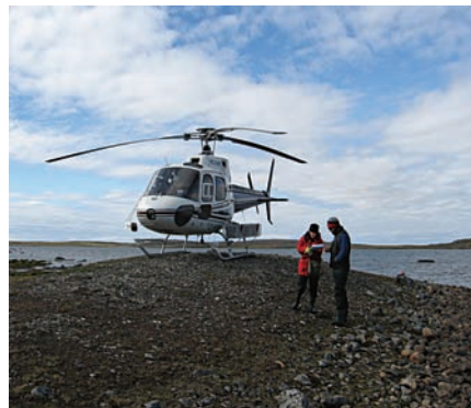
ENVIRONMENTAL BASELINE STUDY – BÉLANGER AND BRAVO PROPERTIES NUNAVIK