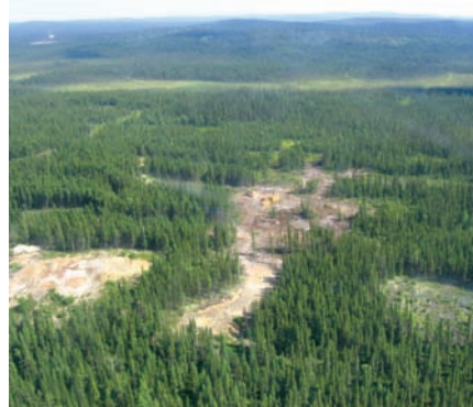
ENVIRONMENTAL BASELINE STUDY, PERMITTING AND IMPACT ASSESSMENT, LAC ROCHER PROPERTY, JAMES BAY