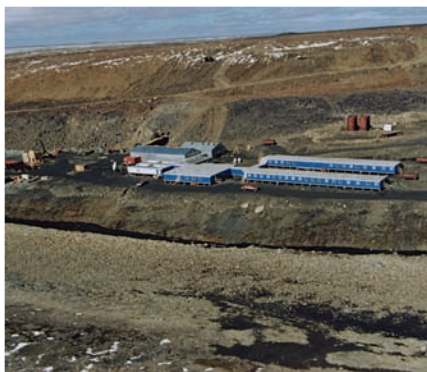
ENVIRONMENT IMPACT ASSESSMENT FOR RAGLAN MINING PROJECT