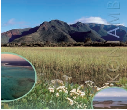
ENVIRONMENT AND SOCIAL IMPACT ASSESSMENT OF THE KONIAMBO PROJECT (NEW CALEDONIA)