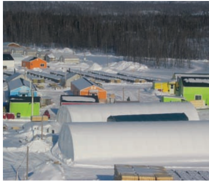
ENVIRONMENTAL BASELINE STUDY – GOLD MINE PROJECT - ÉLÉONORE PROPERTY